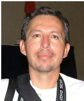
Sergio Ramirez Photography

You met Sergio taking pictures everywhere. Some of his pictures are amazingly good.