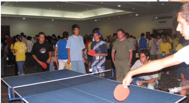
lito passionate games.